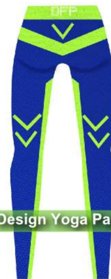
Design Yoga Pants