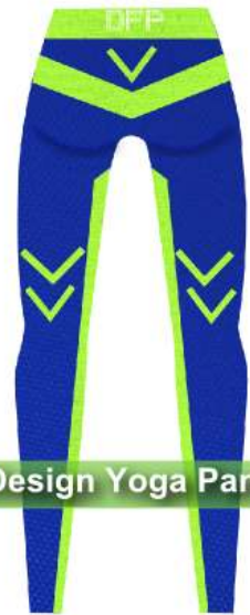
Design Yoga Pants