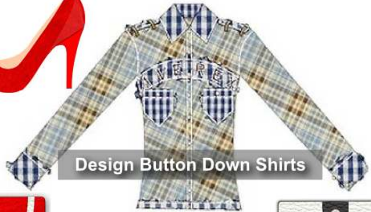
Design Button Down Shirts